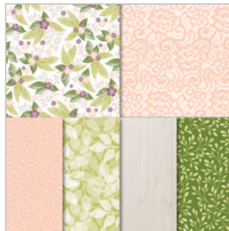
Floral Romance 12" X 12" (30.5 X 30.5 Cm)