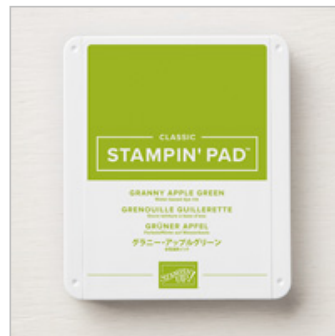
Granny Apple Green Stampin' Pad 147095 Price: $7.50