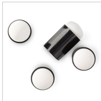
Sponge Daubers 133773 Price: $5.00