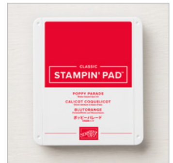
Poppy Parade Classic Stampin' Pad 147050 Price: $7.50