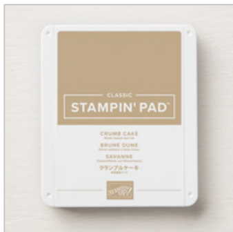
Crumb Cake Classic Stampin' Pad 147116 Price: $7.50