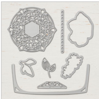
Beautiful Layers Thinlits Dies