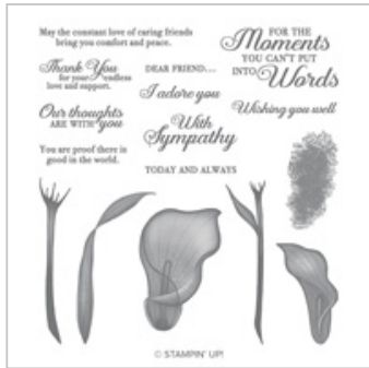
Lasting Lily Photopolymer Stamp Set 149717 Price: $0.00