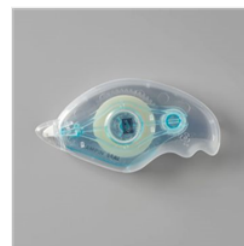
Stampin' Seal - 152813