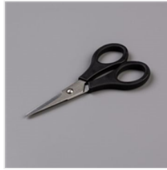
Paper Snips Scissors - 103579