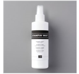
Stampin' Mist - 153648