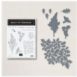
Beauty Of Tomorrow Bundle (English) - 156819

Mary Fish mary@stampinpretty.com http://stampinpretty.com