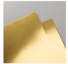
Gold Foil Sheets - 132622