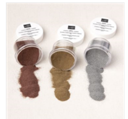
Metallics Embossing Powders - 155555