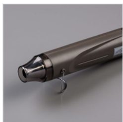
Heat Tool - 129053