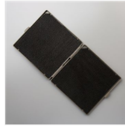
Stampin' Scrub - 126200