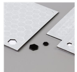
Black Stampin' Dimensionals Combo Pack - 150893