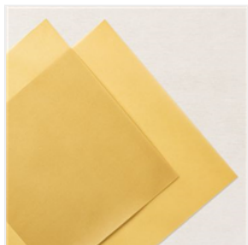
Gold 12" X 12" (30.5 X 30.5 Cm) Shimmer Vellum - 156471