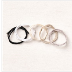
Baker's Twine Essentials Pack - 155475