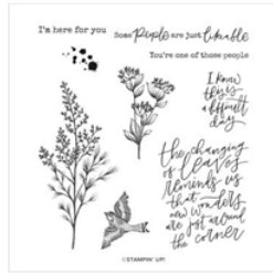
Beauty Of Tomorrow Cling Stamp Set (English) - 156459