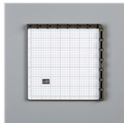
Stamparatus - 146276