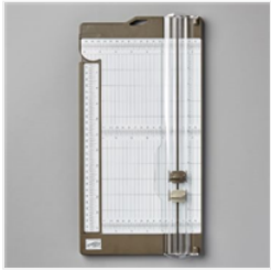
Paper Trimmer - 152392

Mary Fish mary@stampinpretty.com http://stampinpretty.com