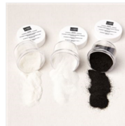
Basics Embossing Powders - 155554