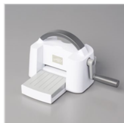
Mini Stampin' Cut & Emboss Machine - 150673