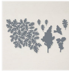
Beautiful Leaves Dies - 156468