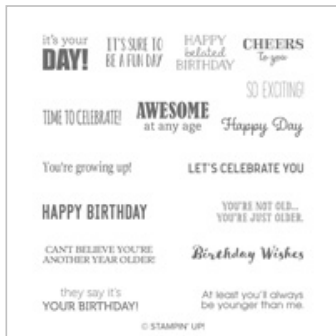
Itty Bitty Birthdays Cling Stamp Set