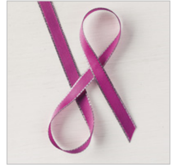
Berry Burst 3/8" (1 Cm) Metallic-Edge Ribbon