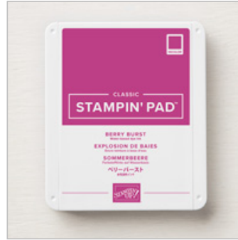
Berry Burst Classic Stampin' Pad