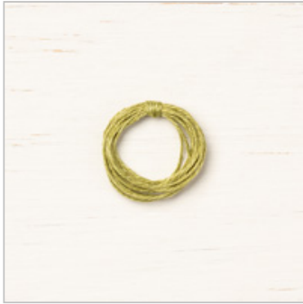
Old Olive Linen Thread