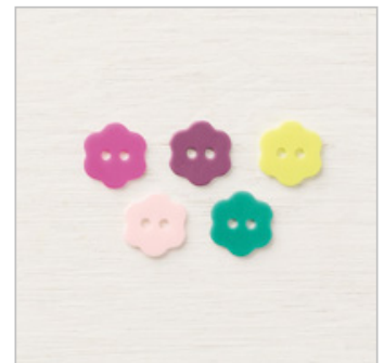
2017-2019 In Color Flower Buttons