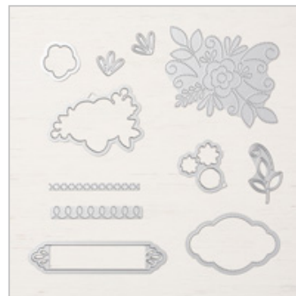
Needlepoint Elements Framelits Dies