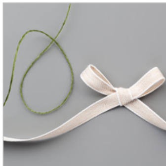
Magnolia Lane Ribbon Combo Pack