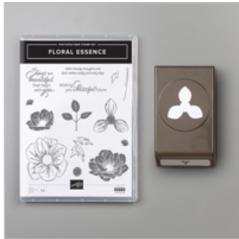
Floral Essence Bundle