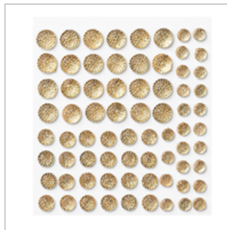
Gold Faceted Gems