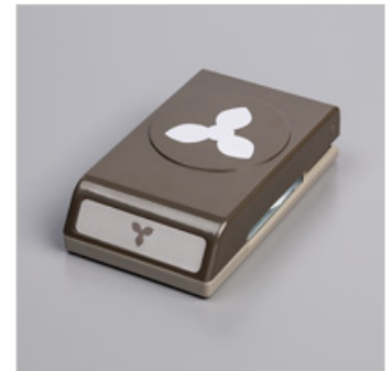
Perennial Flower Punch