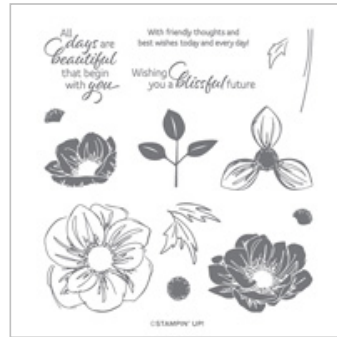
Floral Essence Photopolymer Stamp Set