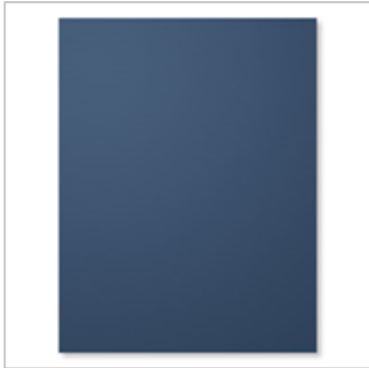
Night Of Navy 8-1/2" X 11" Cardstock