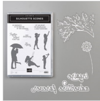
Silhouette Scenes Bundle