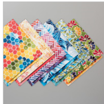
See A Silhouette Designer Series Paper