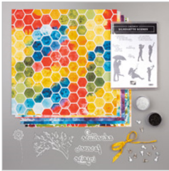
See A Silhouette Suite Bundle