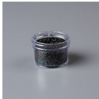
Shimmer Black Stampin' Emboss