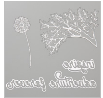
Sweet Silhouettes Dies