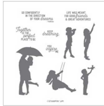
Silhouette Scenes Cling Stamp Set