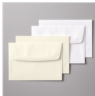
Very Vanilla Note Cards & Envelopes