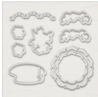
Spot Of Tea Framelits Dies