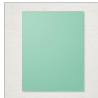
Coastal Cabana 8-1/2" X 11" Cardstock