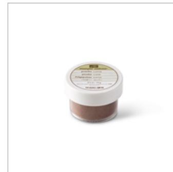
Copper Stampin' Emboss Powder