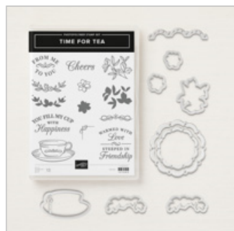
Time For Tea Photopolymer Bundle