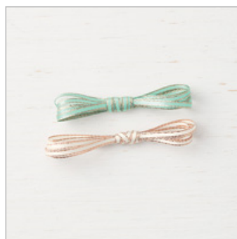
Tea Room Ribbon Combo Pack