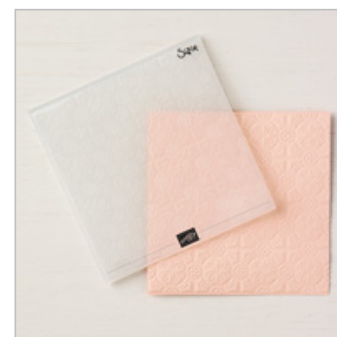
Tin Tile Dynamic Textured Impressions Embossing Folder