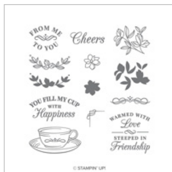
Time For Tea Photopolymer Stamp Set