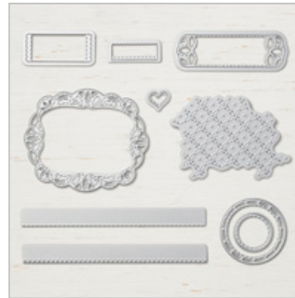
Stitched Labels Framelits Dies