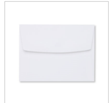
Whisper White Medium Envelopes