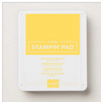
Daffodil Delight Classic Stampin' Pad