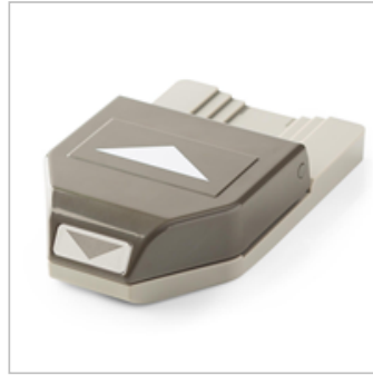
Banner Triple Punch