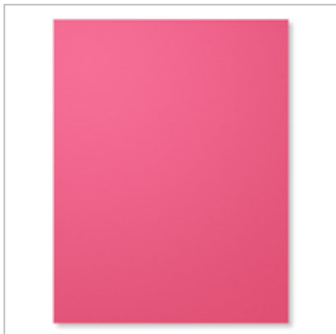
Melon Mambo 8-1/2" X 11" Cardstock