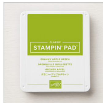
Granny Apple Green Stampin' Pad