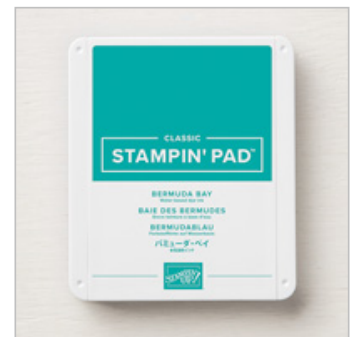
Bermuda Bay Classic Stampin' Pad