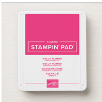
Melon Mambo Classic Stampin' Pad