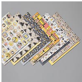
Monster Bash Designer Series Paper