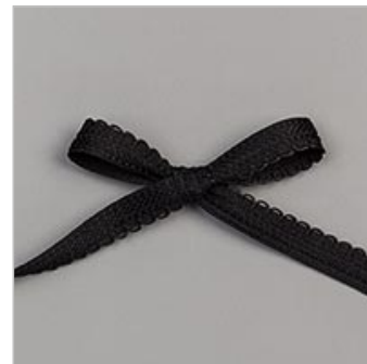
Basic Black 3/8" (1 Cm) Scalloped Edge Ribbon