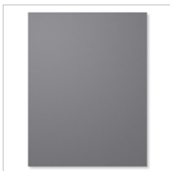
Basic Gray 8-1/2" X 11" Cardstock