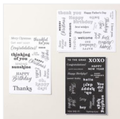
Greetings For All Mix & Match Ephemera Pack (English) - 164862