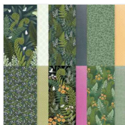
Moonlit Flora 12" X 12" (30.5 X 30.5 Cm) Designer Series Paper - 167737