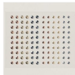
Adhesive-Backed Metallic Gems - 163780