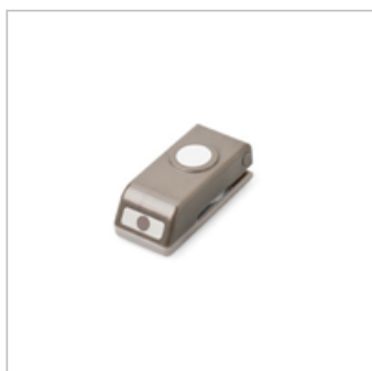
1/2" (1.3 Cm) Circle Punch