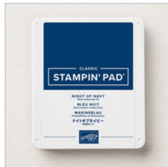
Night Of Navy Classic Stampin' Pad