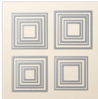
Layering Squares Framelits Dies