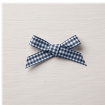
Night Of Navy 1/2" Gingham Ribbon