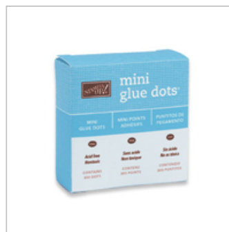
Mini Glue Dots