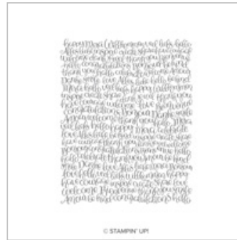
Handwritten Clear-Mount Stamp Set