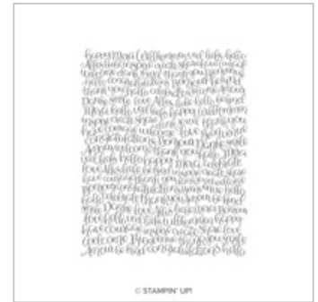
Handwritten Wood-Mount Stamp Set