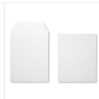
Clear Medium Envelopes