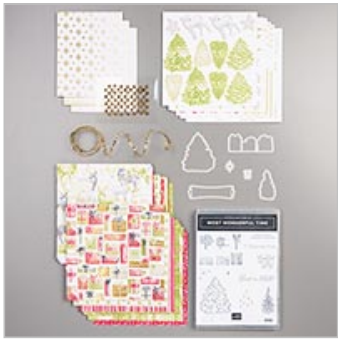
Most Wonderful Time Product Medley (En)