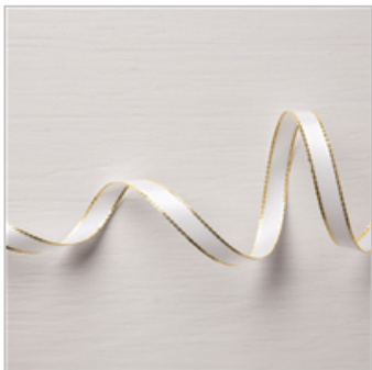
Gold 3/8" (1 Cm) Metallic-Edge Ribbon