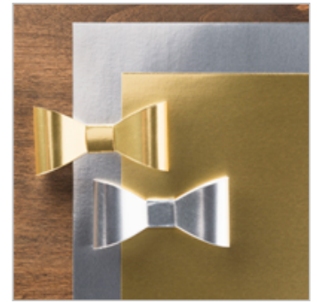
Gold Foil Sheets