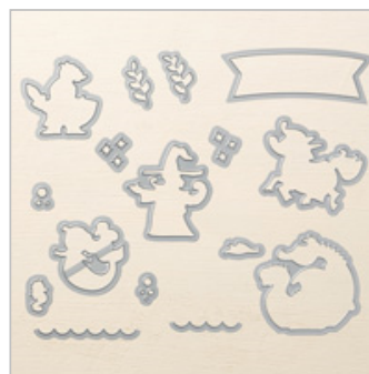
Magical Mates Framelits Dies