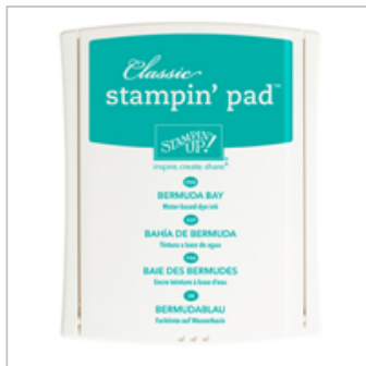
Bermuda Bay Classic Stampin' Pad