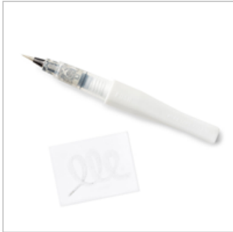
Clear Wink Of Stella