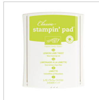
Lemon Lime Twist Classic Stampin' Pad