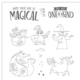
Magical Day Clear-Mount Stamp Set