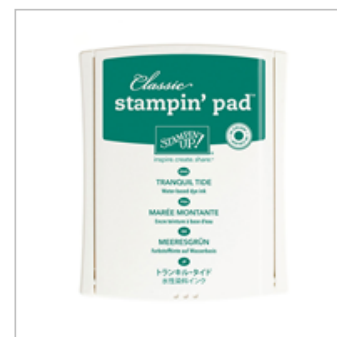
Tranquil Tide Classic Stampin' Pad