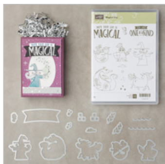
Magical Day Clear-Mount Bundle