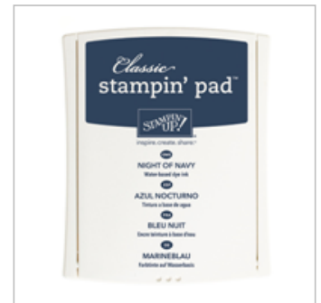
Night Of Navy Classic Stampin' Pad