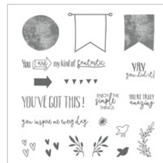
Yay You Photopolymer Stamp Set