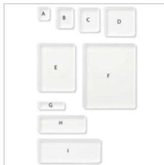
Clear Block Bundle