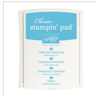
Tempting Turquoise Classic Stampin' Pad