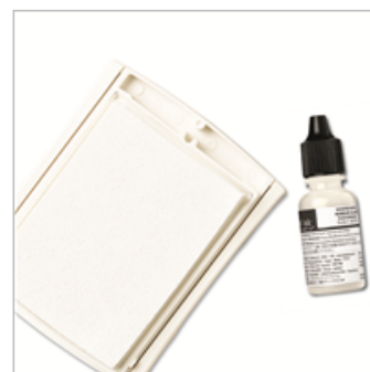
Whisper White Uninked Craft Stampin' Pad & Refill