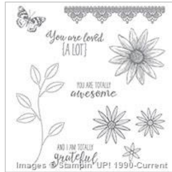
Grateful Bunch Photopolymer Stamp