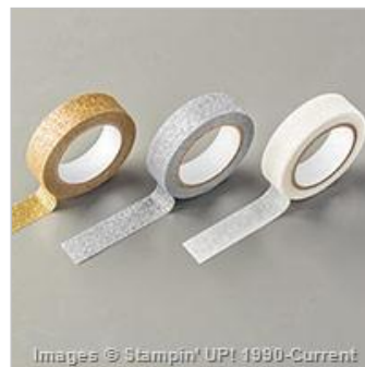
Metallics Glitter Tape