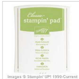
Pear Pizzazz Classic Stampin' Pad