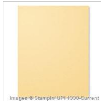
So Saffron 8-1/2" X 11" Cardstock