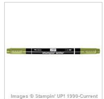
Pear Pizzazz Stampin' Write Marker