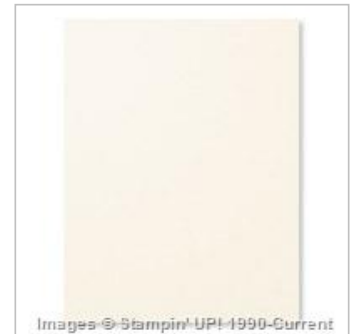
Very Vanilla 8-1/2" X 11" Cardstock