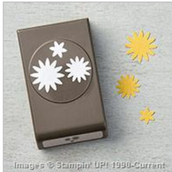
Blossom Bunch Punch