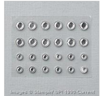
Iced Rhinestone Embellishments