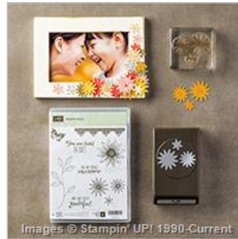
Grateful Bunch Photopolymer Bundle