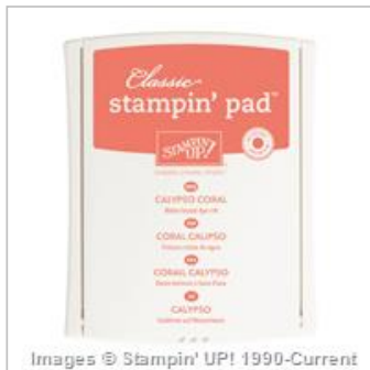
Calypso Coral Classic Stampin' Pad