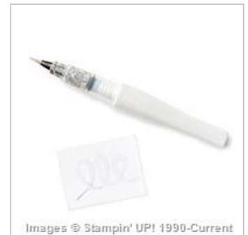
Clear Wink Of Stella Glitter Brush