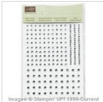
Rhinestone Basic Jewels