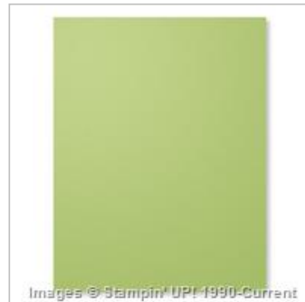
Pear Pizzazz 8-1/2" X 11" Cardstock