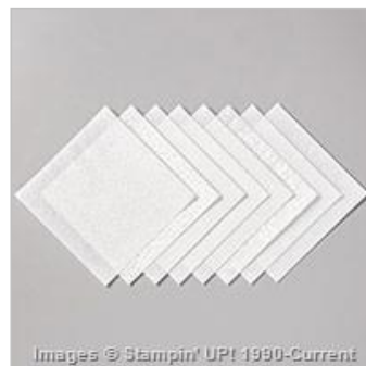
Botanical Gardens Designer Vellum Stack