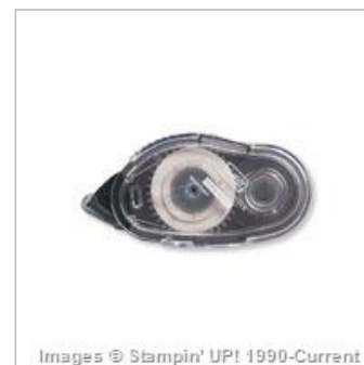
Snail Permanent Adhesive