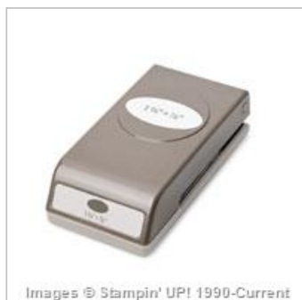
Large Oval Punch