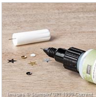
Fine-Tip Glue Pen