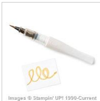
Gold Wink Of Stella Glitter Brush