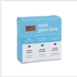
Mini Glue Dots - 103683