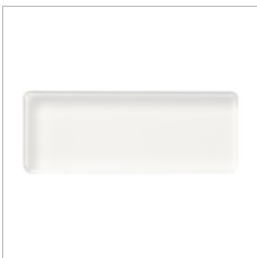
Clear Block I - 118488