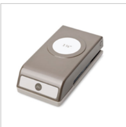
1-3/8" (3.5 Cm) Circle Punch - 119860