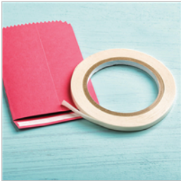
Tear & Tape Adhesive - 138995