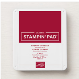
Cherry Cobbler Classic Stampin' Pad - 147083