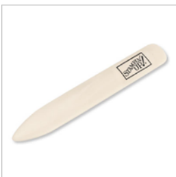
Bone Folder - 102300