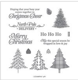
Perfectly Plaid Photopolymer Stamp Set (En) - 149418