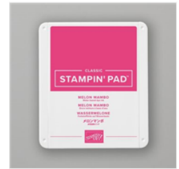
Melon Mambo Classic Stampin' Pad - 147051