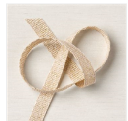
3/8" (1 Cm) Fine Art Ribbon - 154561