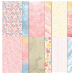
Sand & Sea Designer Series Paper - 154288