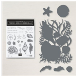
Friends Are Like Seashells Bundle (English) - 156205