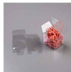
Clear Tiny Treat Boxes - 141699