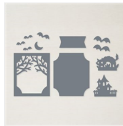
Scary Silhouettes Dies - 159851