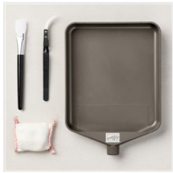
Embossing Additions Tool Kit - 159971