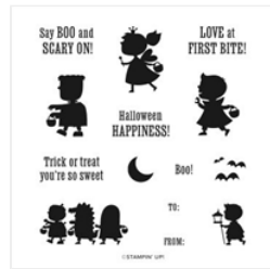
Scary Cute Cling Stamp Set (English) - 159850