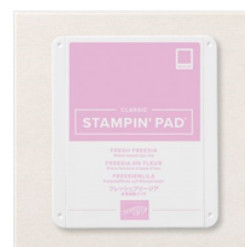
Fresh Freesia Classic Stampin' Pad - 155611