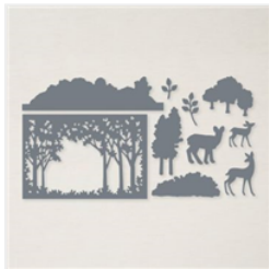
Grove Dies - 157844