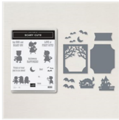
Scary Cute Bundle (English) - 159852

stampcampwithjen@gmail.com stampcampwithjen.com