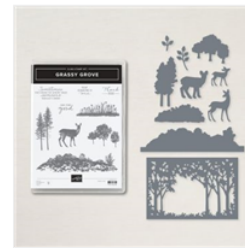
Grassy Grove Bundle (English) - 157845