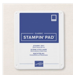
Starry Sky Classic Stampin' Pad - 159212