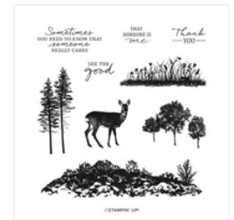
Grassy Grove Cling Stamp Set (English) - 157836