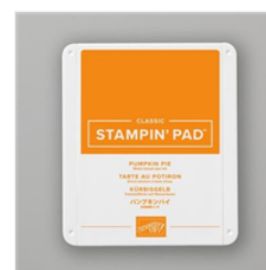
Pumpkin Pie Classic Stampin' Pad - 147086