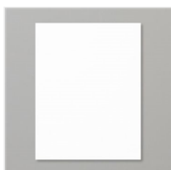
Whisper White 8-1/2 X 11 Cardstock - 100730