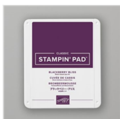
Blackberry Bliss Classic Stampin' Pad - 147092