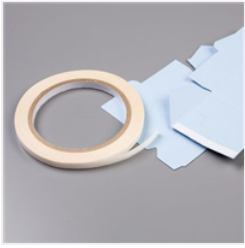
Tear & Tape Adhesive - 138995

stampcampwithjen@gmail.com stampcampwithjen.com