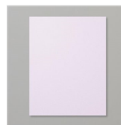
Purple Posy 8-1/2 X 11 Cardstock - 150881