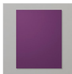
Blackberry Bliss 8-1/2 X 11 Cardstock - 133675