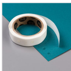
Glue Dots - 103683