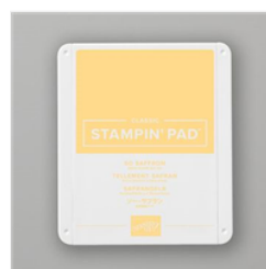
So Saffron Classic Stampin' Pad - 147109