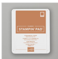
Cinnamon Cider Classic Stampin' Pad - 153114