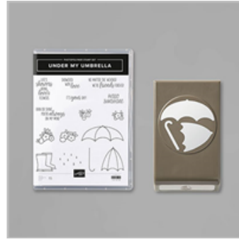
Under My Umbrella Bundle (English)