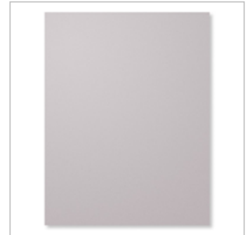
Smoky Slate 8-1/2" X 11" Cardstock