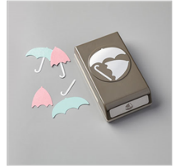
Umbrella Builder Punch