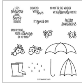
Under My Umbrella Photopolymer Stamp Set (English)