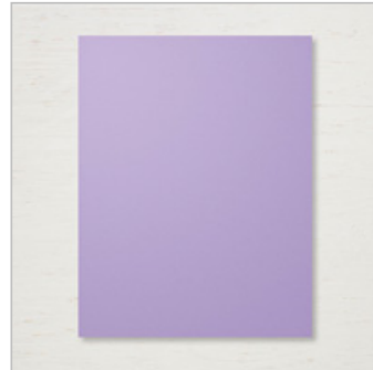
Highland Heather 8- 1/2" X 11" Cardstock