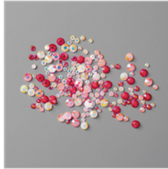
From My Heart Faceted Gems