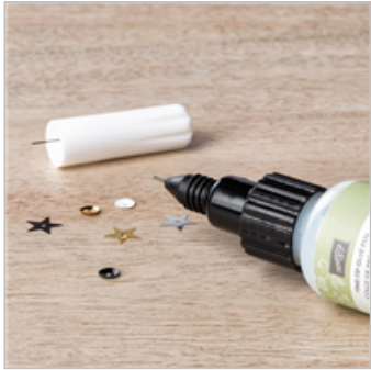
Fine-Tip Glue Pen