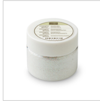
Dazzling Diamonds Stampin' Glitter