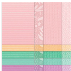
2024-2026 In Color™ 6" X 6" (15.2 X 15.2 Cm) Designer Series Paper - 163777