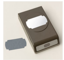
Labeled With Love Punch - 163569