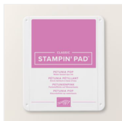
Petunia Pop Classic Stampin' Pad - 163811