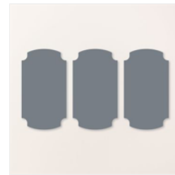
Labeled With Love Dies - 163570