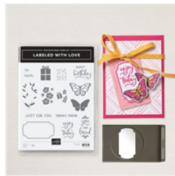
Labeled With Love Punch Bundle (English) - 163571