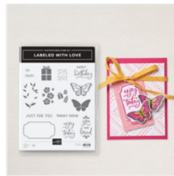
Labeled With Love Photopolymer Stamp Set (English) - 163564