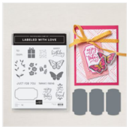
Labeled With Love Dies Bundle (English) - 163574