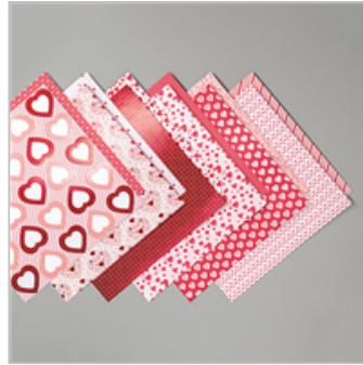
From My Heart Specialty Designer Series Paper