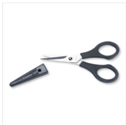
Paper Snips - 103579