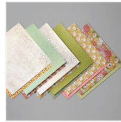
Ornate Garden Specialty Designer Series Paper - 152488