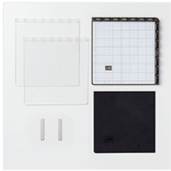
Stamparatus - 146276

stampcampwithjen@gmail.com stampcampwithjen.com