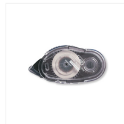
Snail Adhesive - 104332