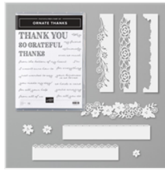
Ornate Thanks Bundle (English) - 154115