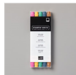
2020-2022 In Color Stampin' Write Markers - 153125