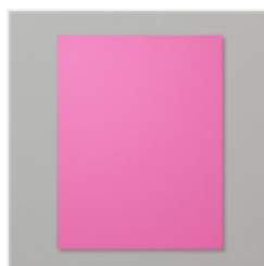
Magenta Madness 8-1/2" X 11" Cardstock - 153080