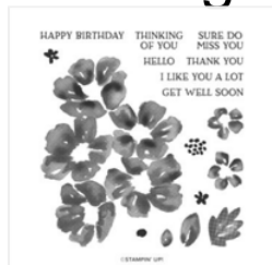
Blossoms in Bloom Photopolymer Stamp Set (English) - 158283