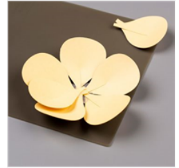
Silicone Craft Sheet - 127853