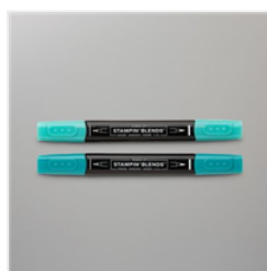
Bermuda Bay Stampin' Blends Combo Pack - 154878