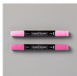
Magenta Madness Stampin' Blends Combo Pack - 153106