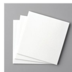
Foam Adhesive Sheets - 152815