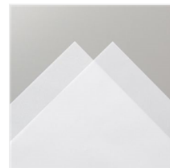
Vellum 8-1/2" X 11" Cardstock - 101856