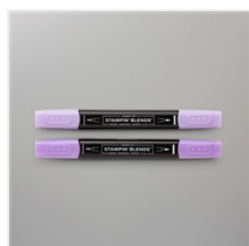
Highland Heather Stampin' Blends Combo Pack - 154887