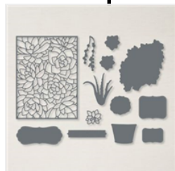
Potted Succulents Dies - 154330