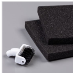
Take Your Pick Die Brush Tip - 149655