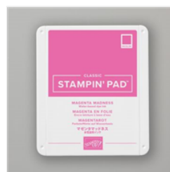
Magenta Madness Classic Stampin' Pad - 153117