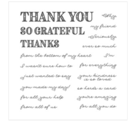
Ornate Thanks Photopolymer Stamp Set (English) - 149471