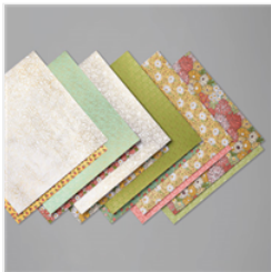
Ornate Garden Specialty Designer Series Paper - 152488