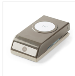
1-1/2" (3.8 Cm) Circle Punch - 138299