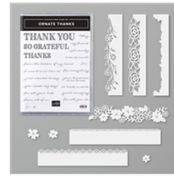
Ornate Thanks Bundle (English) - 154115