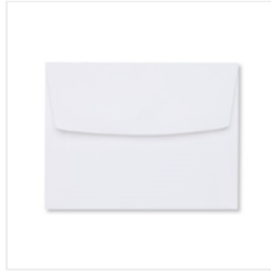
Whisper White Medium Envelopes - 107301