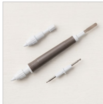
Take Your Pick