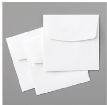
Whisper White 3" X 3" (7.6 X 7.6 Cm)