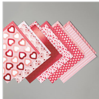
From My Heart Specialty Designer Series Paper