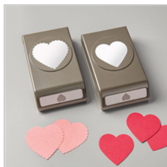
Heart Punch Pack