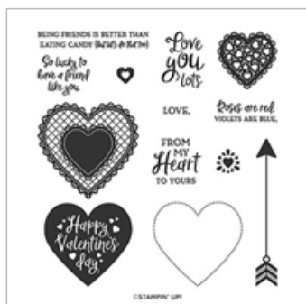
Heartfelt Photopolymer Stamp Set (English)