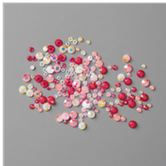
From My Heart Faceted Gems