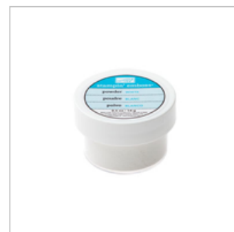
White Stampin' Emboss Powder