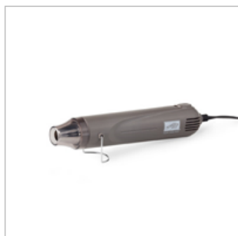
Heat Tool (Us And Canada)