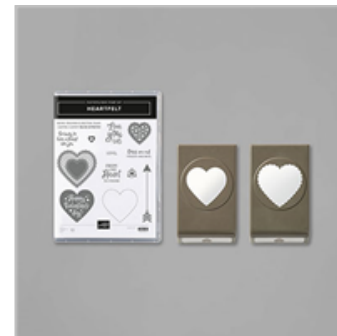
Heartfelt Bundle (English)