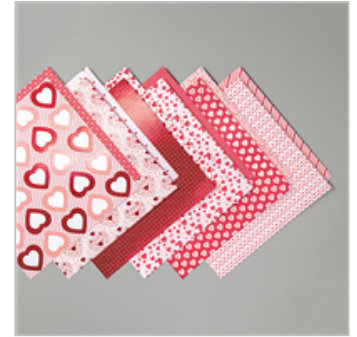
From My Heart Specialty Designer Series Paper