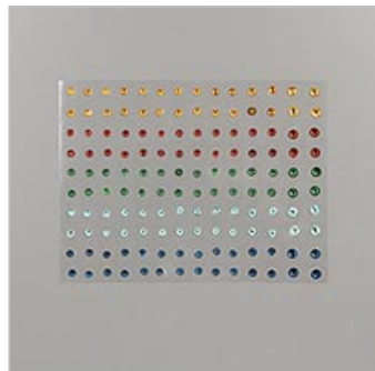
Holiday Rhinestone Basic Jewels