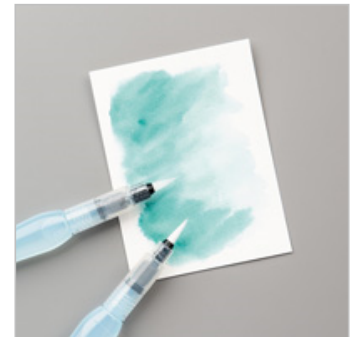
Fluid 100 Watercolor Paper