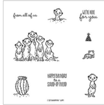
The Gang's All Meer Cling Stamp Set (English)