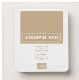
Crumb Cake Classic