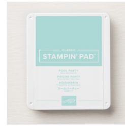
Pool Party Classic Stampin' Pad - 147107