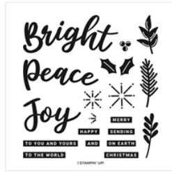
Peace & Joy Photopolymer Stamp Set - 153430