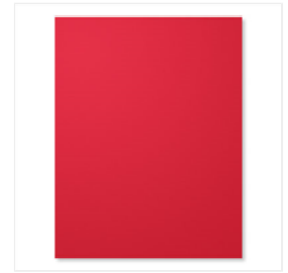
Real Red 8-1/2" X 11" Cardstock - 102482