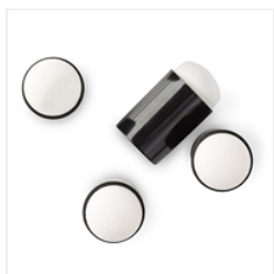
Sponge Daubers - 133773