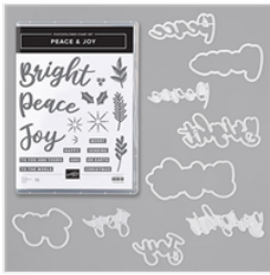
Peace & Joy Bundle - 155167