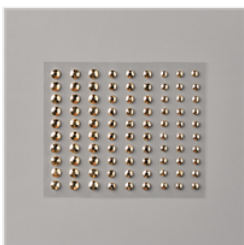
Gilded Gems - 152478