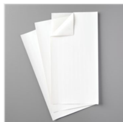
Adhesive Sheets - 152334