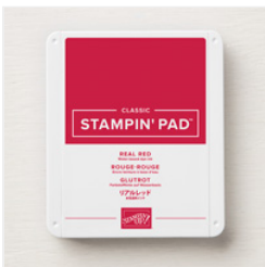
Real Red Classic Stampin' Pad - 147084