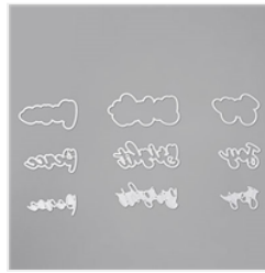
Joy Dies - 153530