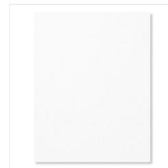
Whisper White 8-1/2" X 11" Cardstock - 100730