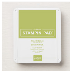
Pear Pizzazz Classic Stampin' Pad - 147104