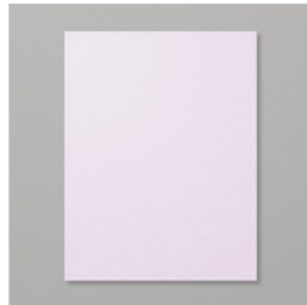
Purple Posy 8-1/2" X 11" Cardstock