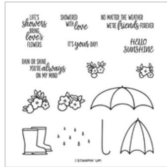
Under My Umbrella Photopolymer Stamp Set (English)