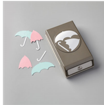
Umbrella Builder Punch