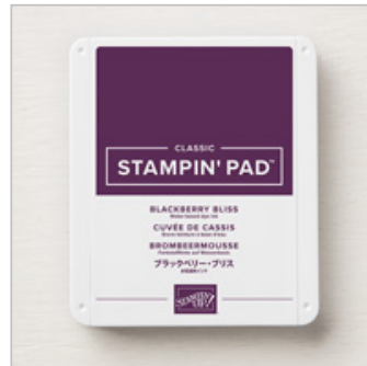
Blackberry Bliss Classic Stampin' Pad