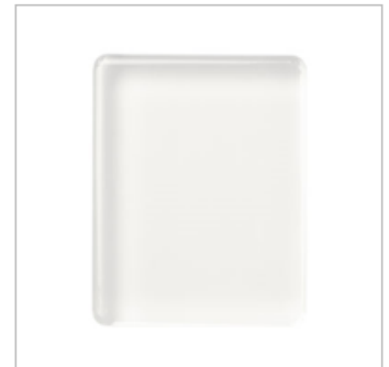
Clear Block E