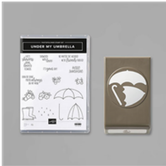
Under My Umbrella Bundle (English)