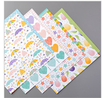
Pleased As Punch Designer Series Paper