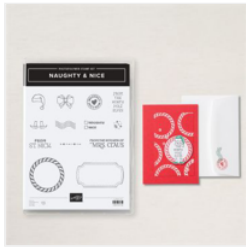
Naughty & Nice Photopolymer Stamp Set (English) - 164358

stampcampwithjen@gmail.com stampcampwithjen.com