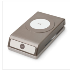
1-3/4" (4.4 Cm) Circle Punch - 119850