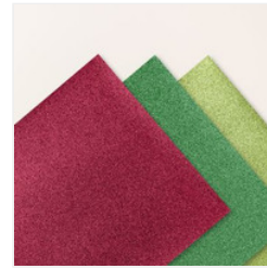
Festive 12" X 12" (30.5 X 30.5 Cm) Glimmer Paper - 164106