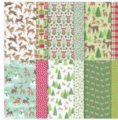
Reindeer Days 12" X 12" (30.5 X 30.5 Cm) Designer Series Paper - 164166