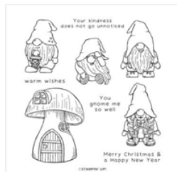
Kindest Gnomes Cling Stamp Set (English) - 159616