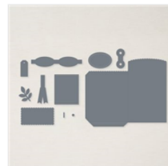
Mini Pocket Envelope Dies - 159167