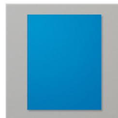
Pacific Point 8-1/2" X 11" Cardstock - 111350