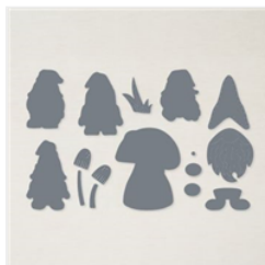
Gnomes Dies - 159625