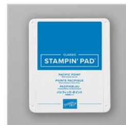
Pacific Point Classic Stampin' Pad - 147098