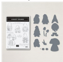
Kindest Gnomes Bundle (English) - 159626