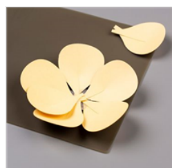
Silicone Craft Sheet - 127853