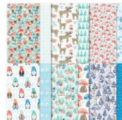
Storybook Gnomes 12" X 12" (30.5 X 30.5 Cm) Designer Series Paper - 159615