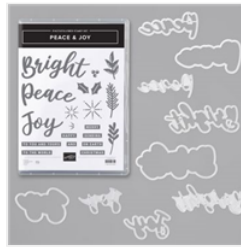
Peace & Joy Bundle - 155167