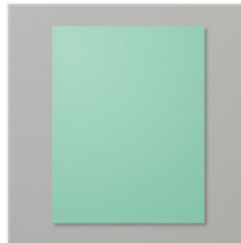
Coastal Cabana 8-1/2" X 11" Cardstock - 131297