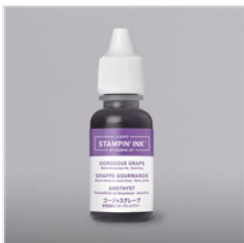
Gorgeous Grape Classic Stampin' Ink Refill - 147164