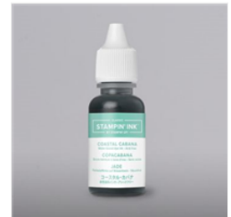
Coastal Cabana Classic Stampin' Ink Refill - 131164