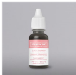
Flirty Flamingo Classic Stampin' Ink Refill - 141402