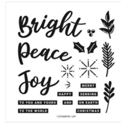
Peace & Joy Photopolymer Stamp Set - 153430