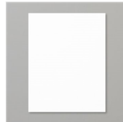
Whisper White 8-1/2" X 11" Cardstock - 100730