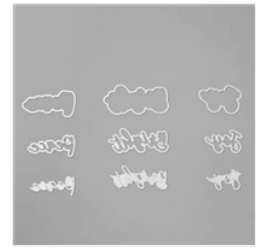
Joy Dies - 153530