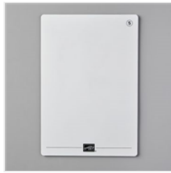
Magnetic Cutting Plate - 149656