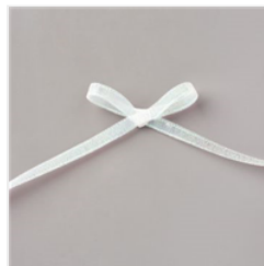
Snowflake Splendor 1/4" (6.4 Mm) Ribbon - 153548