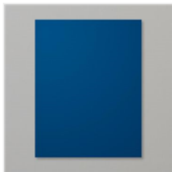
Night Of Navy 8-1/2" X 11" Cardstock - 100867