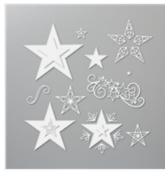
Stitched Stars Dies - 150653