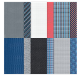
Well Suited 12" X 12" (30.5 X 30.5 Cm) Designer Series Paper - 154562