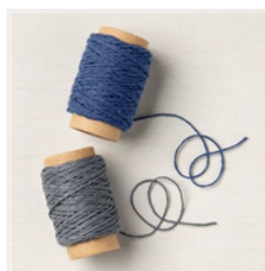
Well Suited Twine Combo Pack - 154566