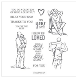
A Good Man Cling Stamp Set (En) - 149270

stampcampwithjen@gmail.com stampcampwithjen.com