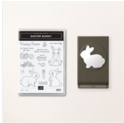
Easter Bunny Bundle (English) - 160606