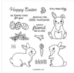
Easter Bunny Photopolymer Stamp Set (English) - 160272