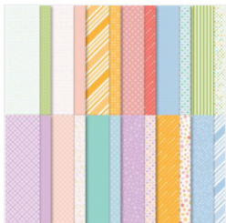
Dandy Designs 12" X 12" (30.5 X 30.5 Cm) Designer Series Paper - 160836