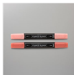
Calypso Coral Stampin' Blends Combo Pack - 154881