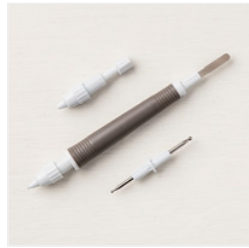
Take Your Pick - 144107