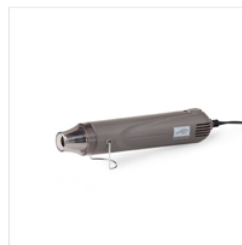
Heat Tool (Us And Canada) - 129053