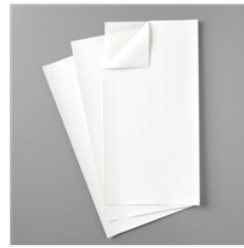
Adhesive Sheets - 152334