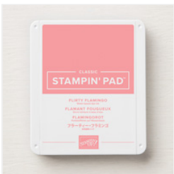
Flirty Flamingo Classic Stampin' Pad - 147052