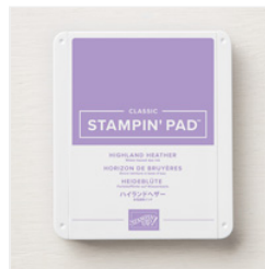
Highland Heather Classic Stampin' Pad - 147103