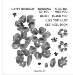
Blossoms In Bloom Photopolymer Stamp Set (English) - 152684