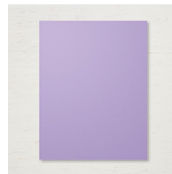
Highland Heather 8-1/2" X 11" Cardstock - 146986