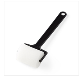
Sponge Brayers - 141714