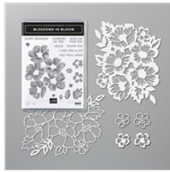
Blossoms In Bloom Bundle (English) - 154123