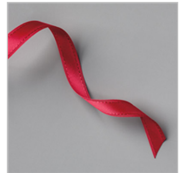
Real Red 3/8" (1 Cm) Double-Stitched Satin Ribbon