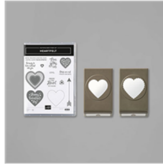
Heartfelt Bundle (English)