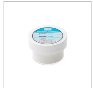
White Stampin' Emboss Powder