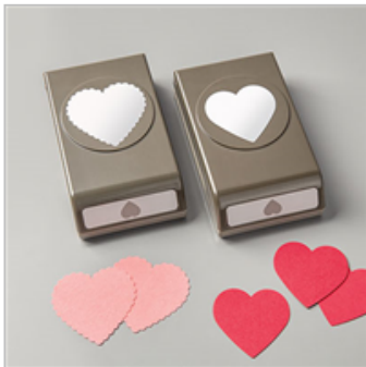
Heart Punch Pack