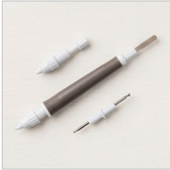
Take Your Pick