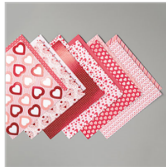
From My Heart Specialty Designer Series Paper