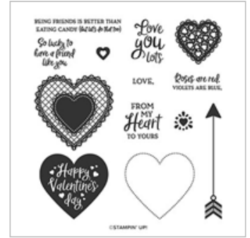
Heartfelt Photopolymer Stamp Set (English)