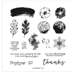
Season Of Chic Photopolymer Stamp Set (English) - 158810