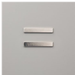
Stamparatus Magnets - 148213