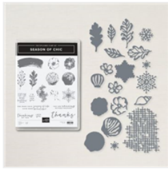
Season Of Chic Bundle (English) - 158816