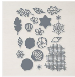
Chic Dies - 158815