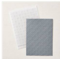
Gingham Embossing Folder - 157627