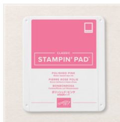
Polished Pink Classic Stampin' Pad - 155712