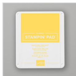
Daffodil Delight Classic Stampin' Pad - 147094