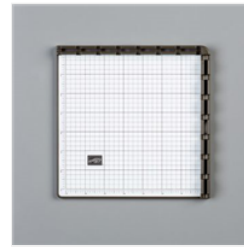
Stamparatus - 146276