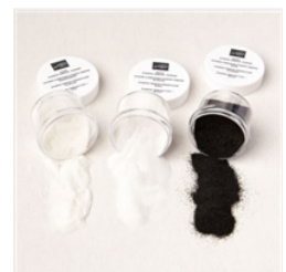
Basics Embossing Powders - 155554