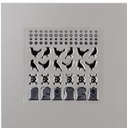
Monster Bash Enamel Shapes - 150448