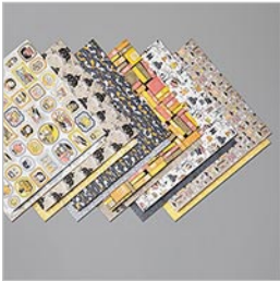
Monster Bash Designer Series Paper - 150447