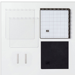
Stamparatus - 146276