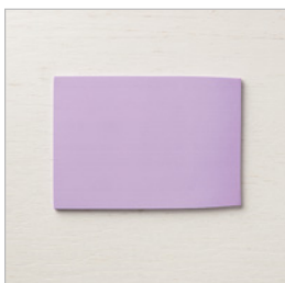
Simply Shammy - 147042