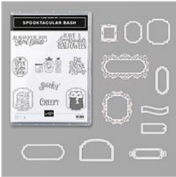
Spooktacular Bash Bundle - 153040