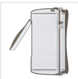
Stampin' Trimmer - 126889