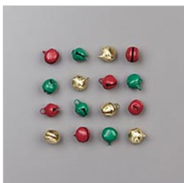
Jingle Bells - 149598