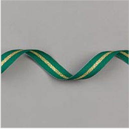
Shaded Spruce/Gold 3/8" (1 Cm) Striped Ribbon - 149597