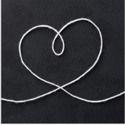
Whisper White Solid Baker's Twine - 124262