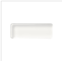
Clear Block H - 118490