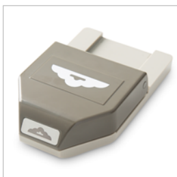
Scalloped Tag Topper Punch - 133324