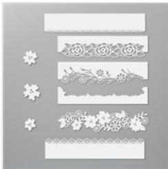
Ornate Borders Dies - 152724