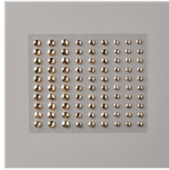
Gilded Gems - 152478