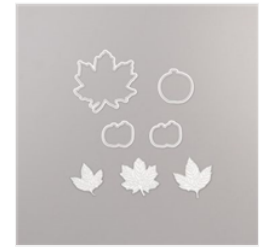
Gathered Leaves Dies - 150662