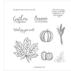
Gather Together Photopolymer Stamp Set - 150589