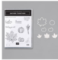
Gather Together Bundle - 153036