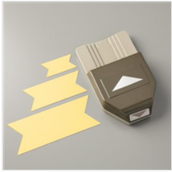
Triple Banner Punch - 138292

stampcampwithjen@gmail.com stampcampwithjen.com