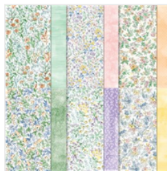
Hand-Penned 12" X 12" (30.5 X 30.5 Cm) Designer Series Paper - 155499