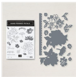
Hand-Penned Petals Bundle (English) - 155492

Click on any of the supplies in the product showcase below to purchase them in my online store, thank you!