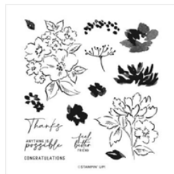
Hand-Penned Petals Photopolymer Stamp Set - 155070