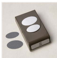
Double Oval Punch - 154242