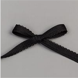
Basic Black 3/8" (1 Cm) Scalloped Edge Ribbon - 150449