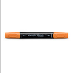
Pumpkin Pie Dark Stampin' Blends Marker - 144577