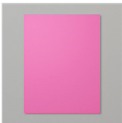
Magenta Madness 8-1/2" X 11" Cardstock - 153080