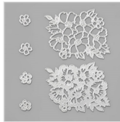
Many Layered Blossoms Dies - 153582