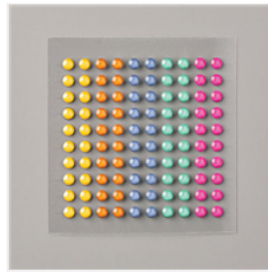
2020-2022 In Color Enamel Dots - 152480