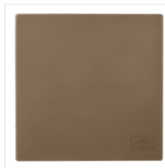
Silicone Craft Sheet - 127853