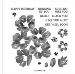
Blossoms In Bloom Photopolymer Stamp Set (English) - 152684