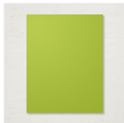
Granny Apple Green 8-1/2" X 11" Cardstock - 146990