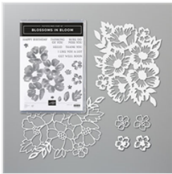
Blossoms In Bloom Bundle (English) - 154123

stampcampwithjen@gmail.com stampcampwithjen.com