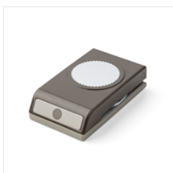
Starburst Punch - 143717