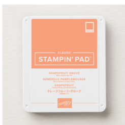
Grapefruit Grove Classic Stampin' Pad - 147142