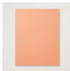
Grapefruit Grove 8-1/2" X 11" Cardstock - 146972