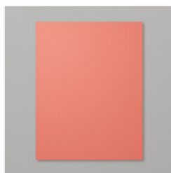
Terracotta Tile 8-1/2" X 11" Cardstock - 150884