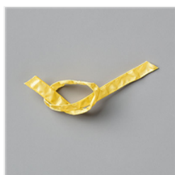
Daffodil Delight 1/4" (6.4 Mm) Ruched Ribbon - 151311