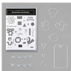
Bonanza Buddies Bundle - 153815