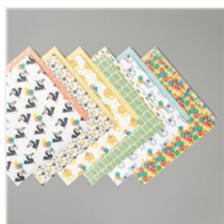
Birthday Bonanza Designer Series Paper - 151313