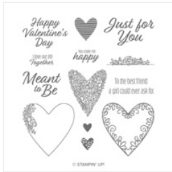
Meant To Be Cling Stamp Set - 148626