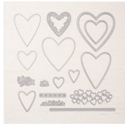
Stitched Be Mine Dies - 148527