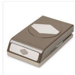
Tailored Tag Punch - 145667