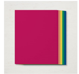
In Color 2018-2020 8-1/2" X 11" Cardstock - 146973