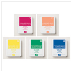
Classic Stampin' Pad Assortment In Color 2018-2020 - 147153