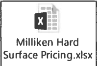
EXHIBIT B MILLIKEN AUTHORIZED HARD SURFACE PRICING