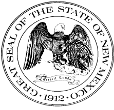
Exhibit E: Master Agreement State of New Mexico General Services Department