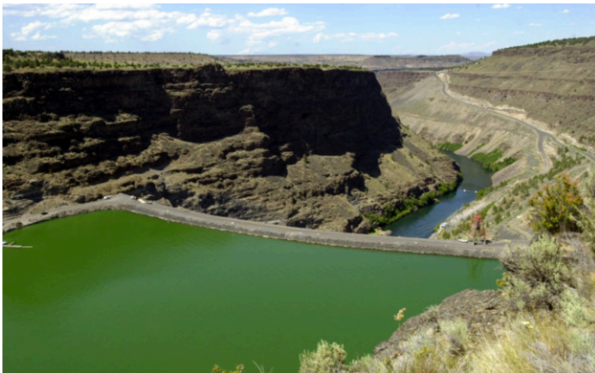
Round Butte Dam holds back the waters of the Deschutes River to form Lake Billy Chinook near Madras, Ore., Tuesday, July 13, 2004.

by Amanda Peacher, Updated: Aug. 17, 2016