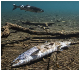
Heat-stressed sockeye in the Little White Salmon River, a Columbia tributary, 2015.

http://www.nwcouncil.org/news/blog/sockeye-warm-water-update-june-2016/