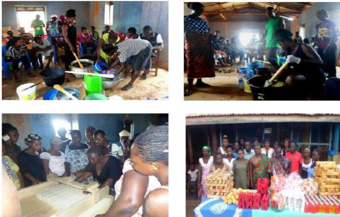
Fig 2: Participants at CBT in Soap Making WORKSHOP AND MANAGEMENT PRACTICE AND STAKEHOLDERS MEETING AT TEPA