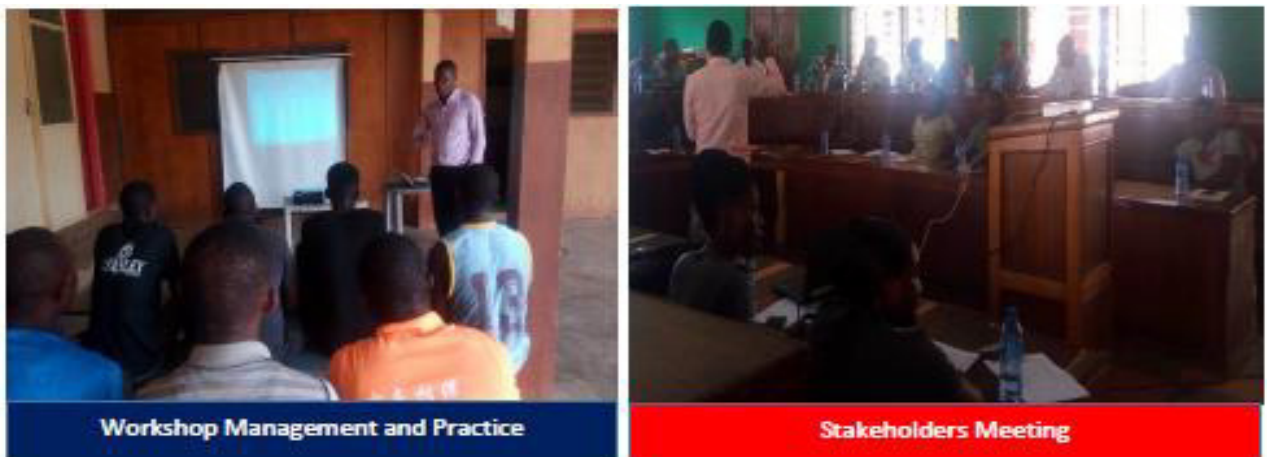
Fig 2.1: Participants at Workshop on Management Practice