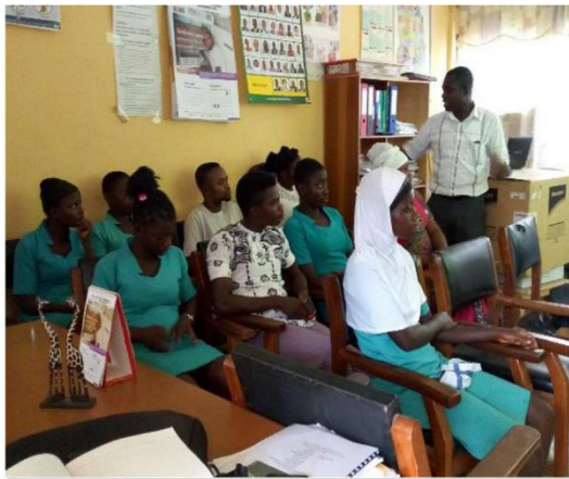
Facilitator giving 5S training to participants (both CEOs and their employees)