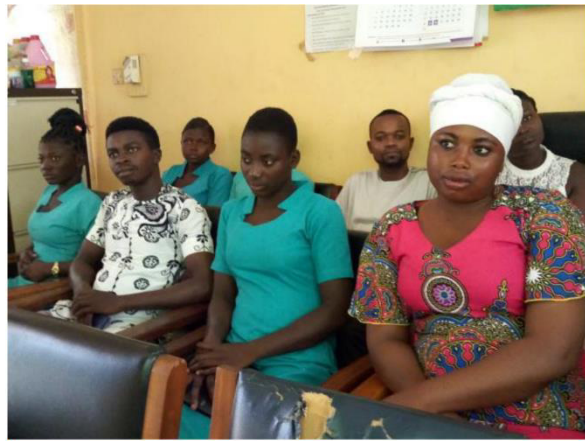
Participants (both CEOs and their employees) actively involved in the 5S training