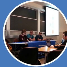
MICU Team 2/2015