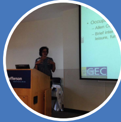
Falls Clinic Team 11/2014