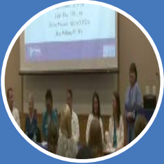
SICU Team 4/2014