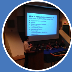
Dispo Dilemma/Rehab Team 10/2014