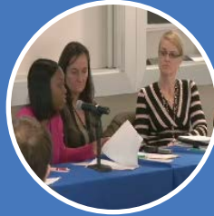
Senior Adult Oncology Team 1/2015